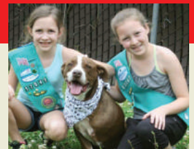
Girl Scout Troop #17547